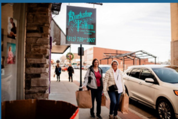
Shop Small Saturday Pages 11-12