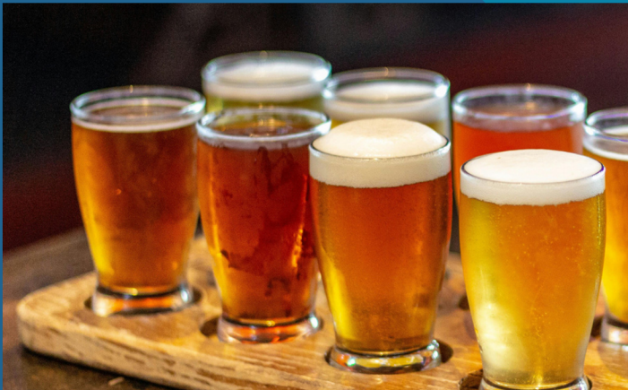
Fall Festival | First-Year Event with Annual Growth Potential

HallowBrew & Vine is an immersive, full-day downtown tasting festival bringing beer, wine, and spirits to Main Street in a fun, festive atmosphere. Guests travel storefront to storefront sampling wines from local wineries, while beer, bourbon, and spirits lovers gather at the Chamber for cornhole, football, and a laid-back hangout vibe. The event also features a KidZone, live music at The Commons, a curated boutique vendor village, a blow-out bar, charcuterie and flower-arranging classes, and more—making it a true something-for-everyone experience. This inaugural event is designed to grow into a signature annual festival with strong sponsorship visibility.