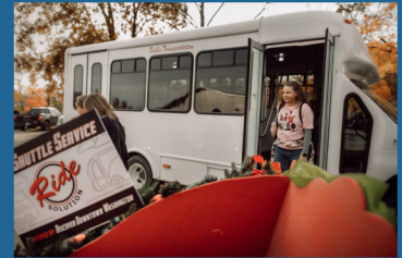
Open House Pages 9-10