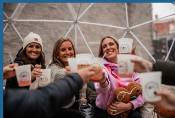
Christmas on Main Pages 13-14