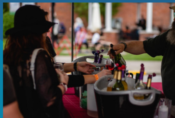
Hallow Brew + Vine Pages 19-20