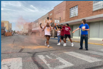
Color Walk/Run Pages 5-6

Event sponsorships offer a meaningful way to support Discover Downtown Washington while gaining visibility at the heart of our community. By sponsoring a downtown event, you help bring people together, celebrate local culture, and create vibrant experiences that drive foot traffic and economic activity. Your partnership helps make these events possible while showcasing your commitment to the revitalization and continued success of downtown Washington.