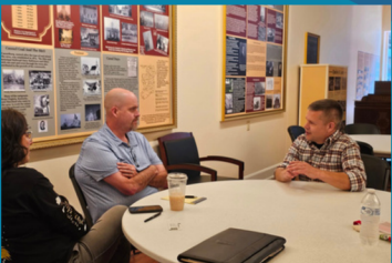
Lunch & Learns Pages 17-18