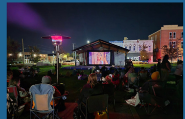
Outdoor Movie Nights Pages 15-16