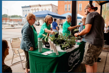
Farmers Market Pages 7-8