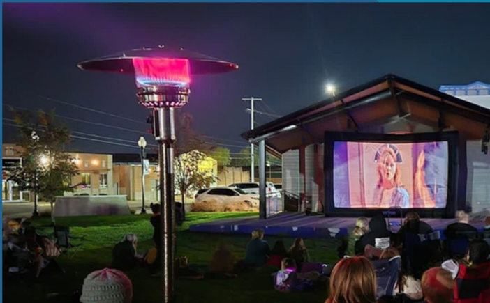
Family-Friendly | Community Favorite

Let's take the big screen outside! Downtown Outdoor Movie Nights bring families together for a relaxed, fun-filled evening under the stars. Guests grab blankets and lawn chairs and settle in for a family-friendly movie experience in the heart of downtown. With nearby dining, snacks, and a welcoming community atmosphere, these nights create memorable moments while encouraging visitors to enjoy downtown before and after the show—making them a perfect sponsorship opportunity with high visibility and broad appeal.